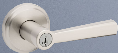
Trafford Lever with SmartKey Security in Satin Nickel